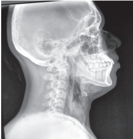
FIG 1. X-ray neck lateral view showing subcutaneous emphysema