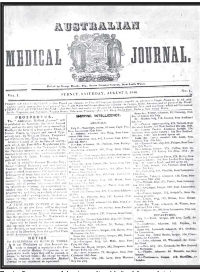
Fig 1. Cover page of the Australian Medical Journal, 1 August

A prospectus (indicated as 'An address from the editor' in the table of contents) on page 1 introduces the purposes of AMJ —subsequently referred as 'objects'—clarifying that AMJ would