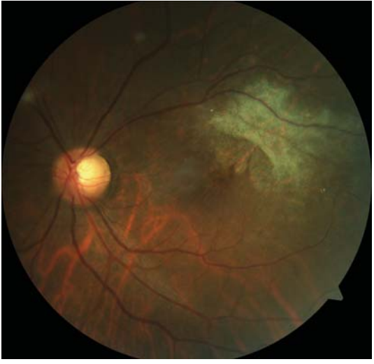
superotemporal arcade suggesting healed cytomegaloviral retinitis.

A 42-year-old man with acquired immunodeficiency syndrome (AIDS) and CD4 count of 44/µl (500–1200/µl) presented with active cytomegaloviral (CMV) retinitis in the left eye. A large patch of whitish retina (retinitis) is seen with adjacent intraretinal haemorrhage along the superotemporal arcade (Fig. 1). His right eye was blind due to extensive CMV retinitis and optic atrophy. With highly active antiretroviral therapy, oral valganciclovir and repeated intravitreal ganciclovir injections in the left eye, the retinitis resolved completely leaving a retinal scar (Fig. 2). CMV retinitis remains the commonest opportunistic ocular infection in patients with AIDS. Oral valganciclovir and multiple intravitreal ganciclovir injections help in resolution of retinitis and maintenance of the visual acuity of such patients.