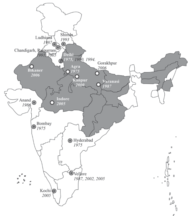
Fig 2. Map of India showing states with lower per capita state domestic product (<Rs 25 000). The other states have a per capita state domestic product ranging from Rs 30 000 to Rs 90 000. (Data from State Series—Statement: per capita NSDP [state income] at current prices as on 31 August 2007, Central Statistical Organization). Places where school/ population surveys on prevalence of rheumatic heart disease are conducted are shown. All the recent school surveys have been done in urban and semiurban areas.

It appears that RHD in India has actually declined in some parts of the country and continues unabated in some other regions. The reasons for this duality in the epidemiology of RHD in India are